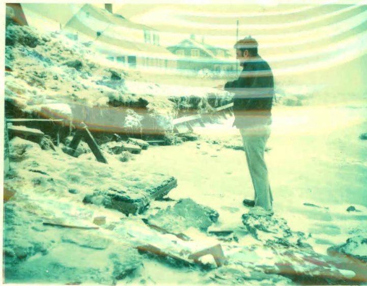
9th St. off E. Grande wooden seawall cement block & slab steps completely gone. 2/7/78