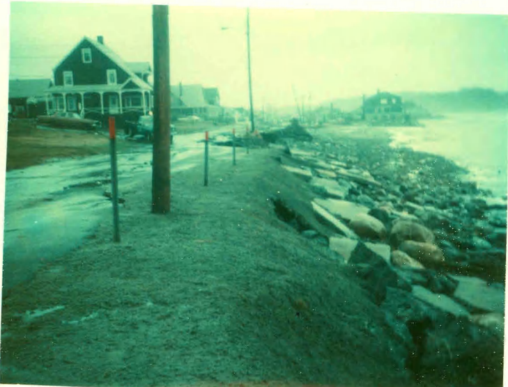
Between Ocean & Houghton on Bayview 1/9/78