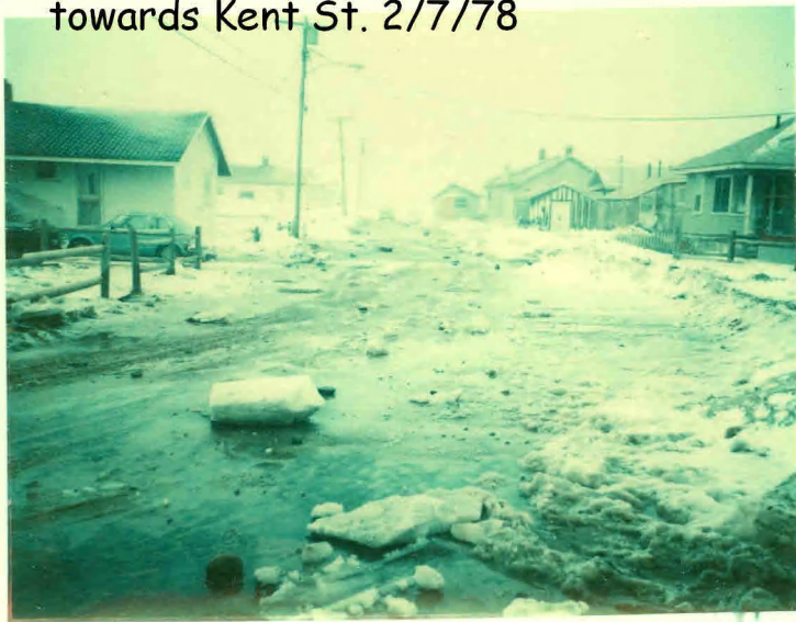
Bayview Ave. Ext from Champion St towards Kent St. 2/7/78