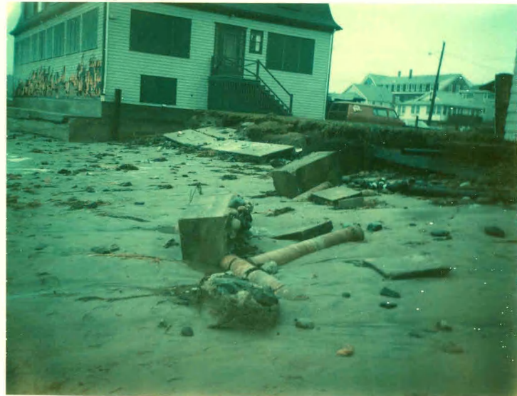
Silver Sands sewage system 1/9/78