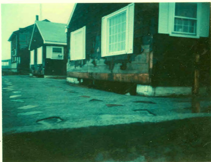
Champion St. public way to beach 1/9/78