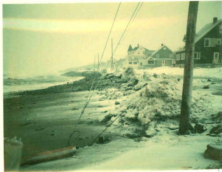
Morning St. 1/9/78