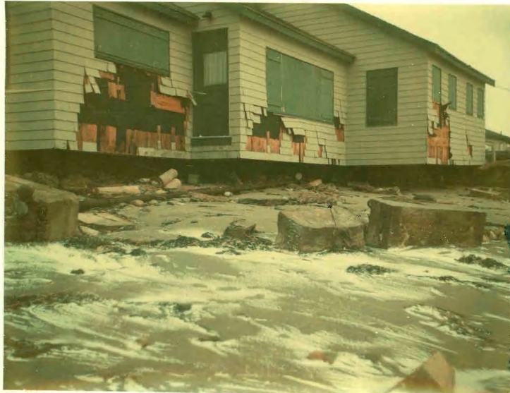
Silver Sands next to Morning St. 1/10/78