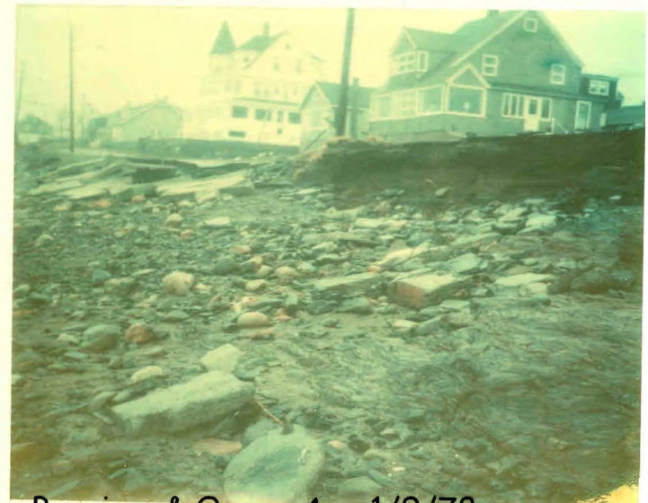
Bayview & Ocean Ave 1/9/78