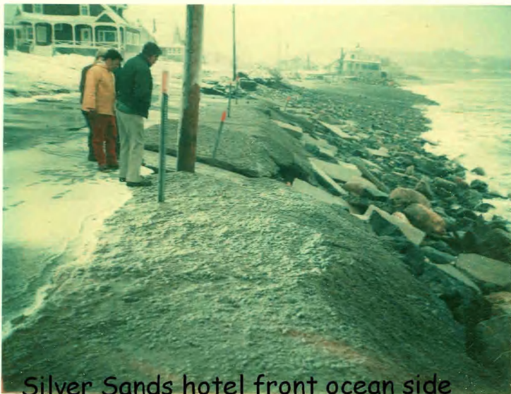
Silver Sands hotel front ocean side front foundation gone 2/7/78