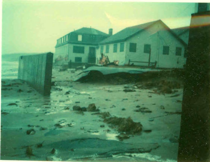
Bayview Ave from Pearl St. towards Ocean Ave. Rd front erosion. 2/7/78