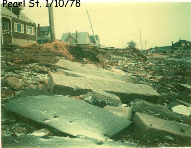
Bayview Ave looking from Ocean St. to Pearl St. 1/10/78