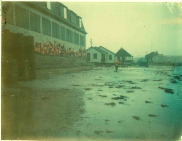
Silver Sands 1/9/78