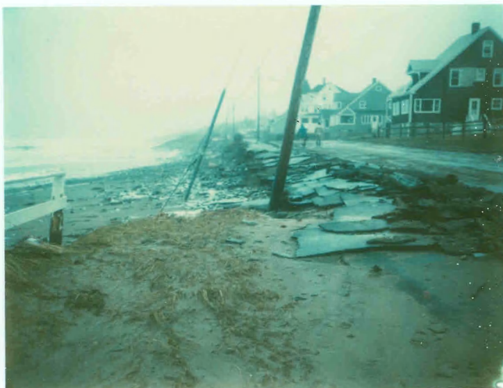
BAYVIEW AVE 1/9/78