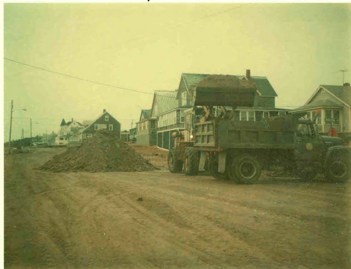
Debris on Bayview Ave. 1/10/78