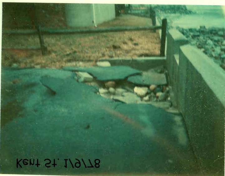
Kent St. 1/9/78