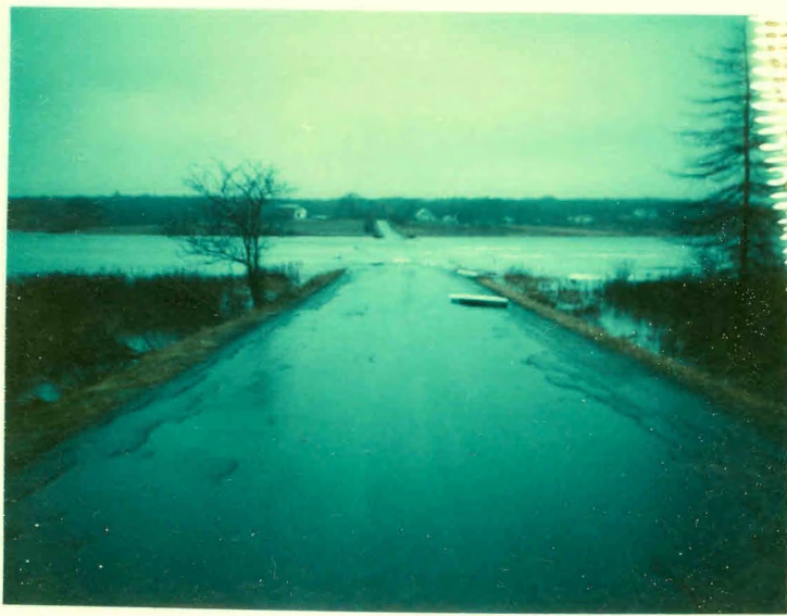
Saywer St. town line 1/9/78