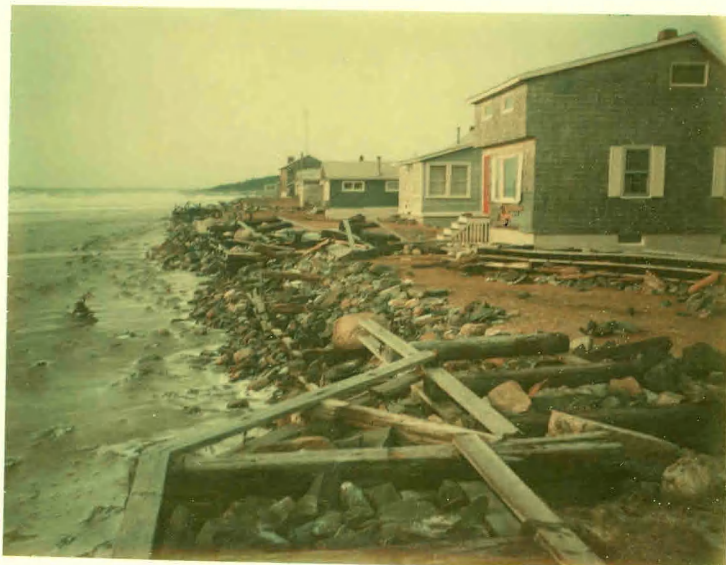
From Kent back along Bayview 1/10/78