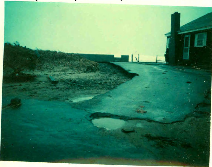
Champion St public way to beach 1/9/78