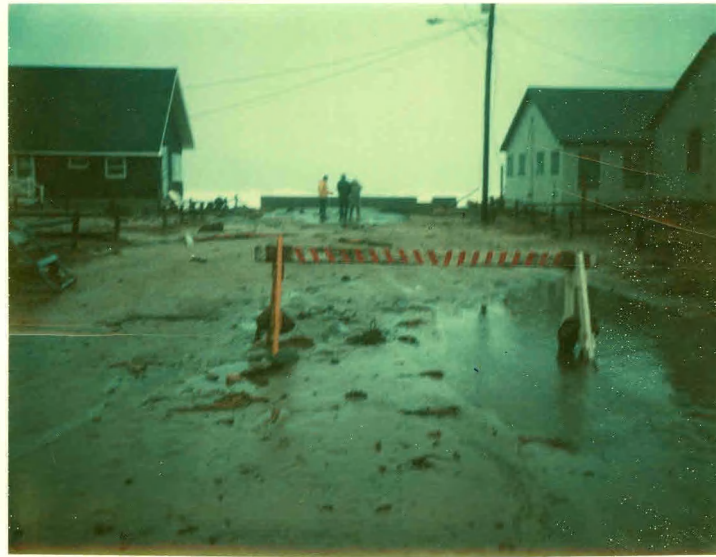
Morning St. 1/9/78