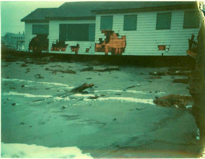
Morning St 1/9/78