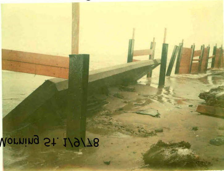
Morning St. town bulkhead & remains of new sea wall to right of bulkhead. 2/7/78