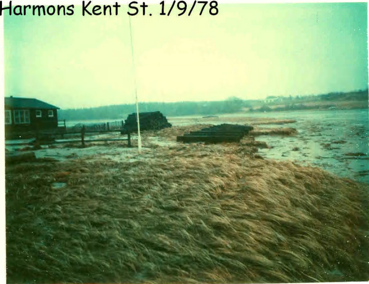
Harmons Kent St. 1/9/78