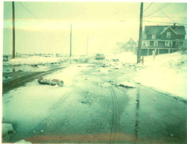
Bayview Ave from Morning St. toward Pearl St. 2/7/78