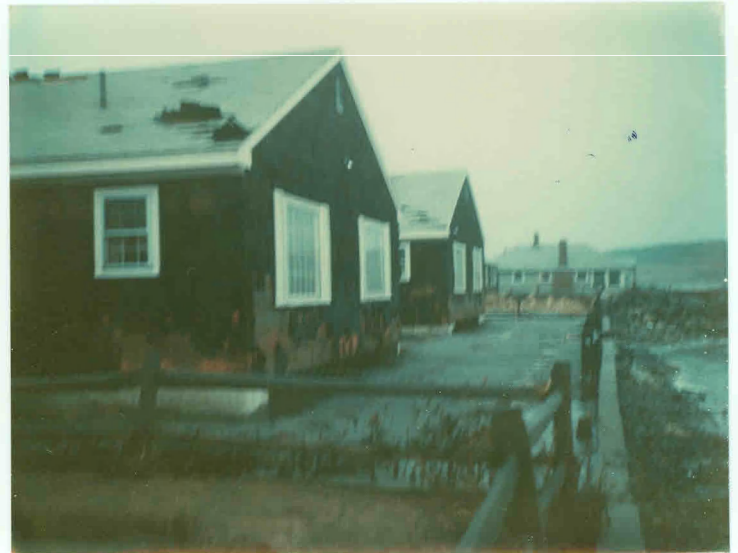
CHAMPION ST & VESPER ST 1/9/78