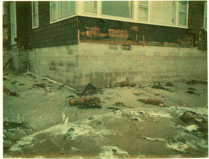
North side Morning St. @ Buckhead 1/10/78