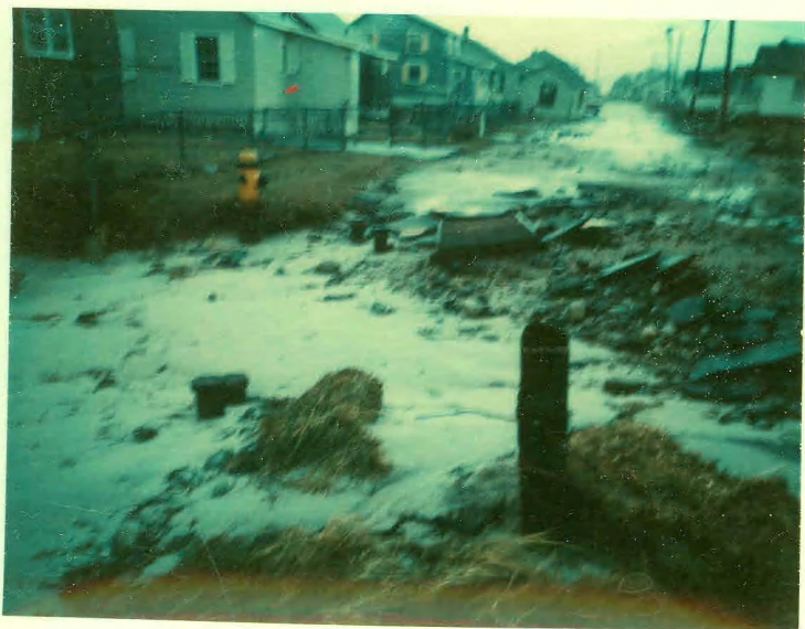
Kent St. 1/9/78