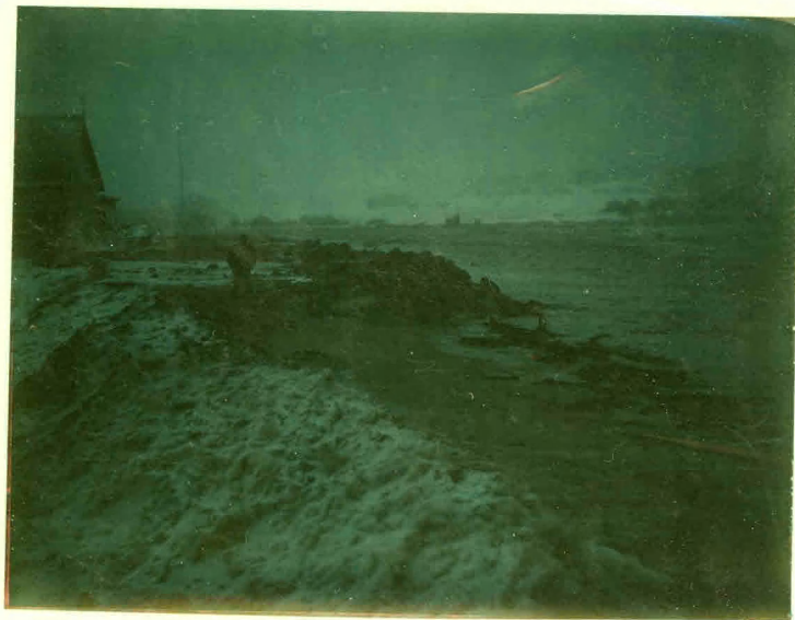
Kent St. Bayview Ext. at Kent St. 2/7/78