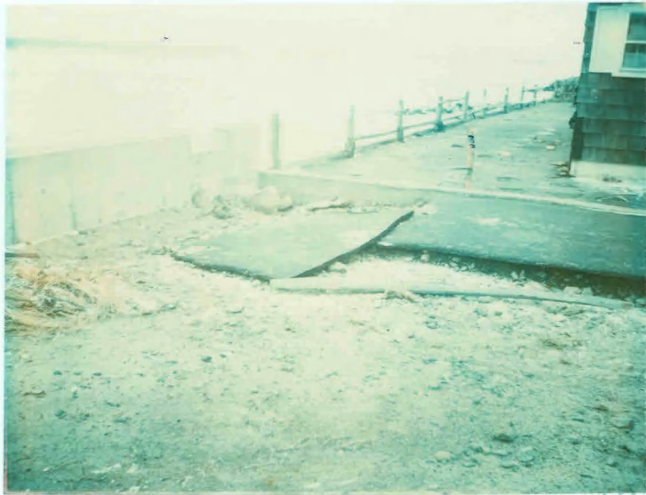
CHAMPION ST 1/10/78