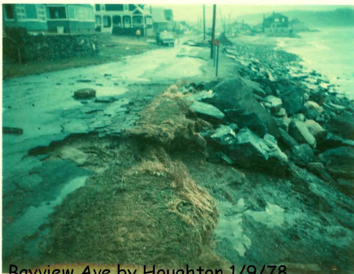
Bayview Ave by Houghton 1/9/78