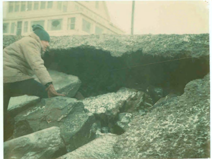
WASHOUT BETWEEN OCEAN ST & HOUGHTON ST 1/10/78