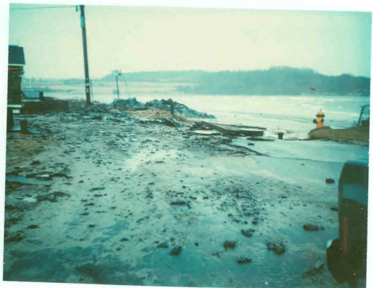
KENT ST 1/9/78