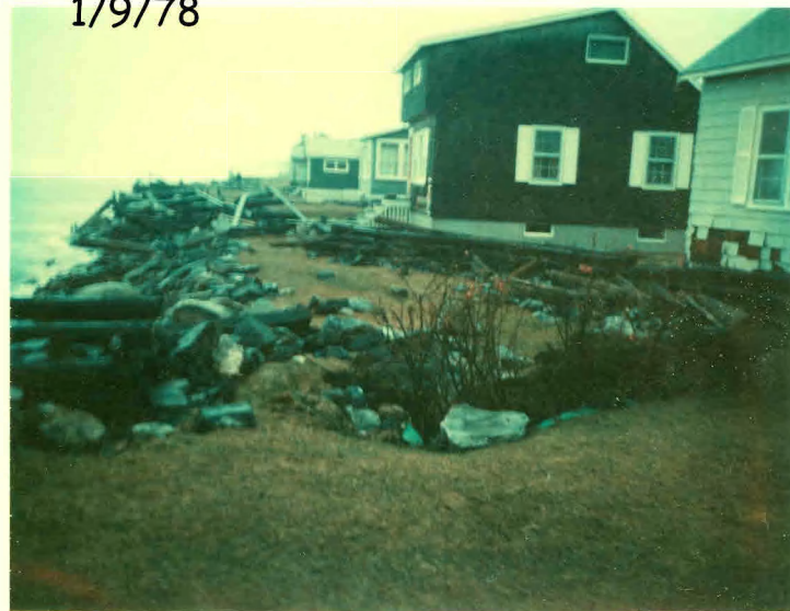
In front of cottages on Bayview Ave 1/9/78