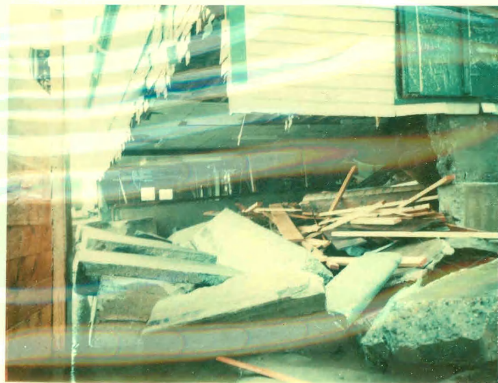
Silver Sands hotel 2/7/79