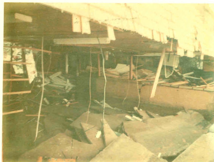
Bayview Ave. front of Laughton Htl 2/7/78