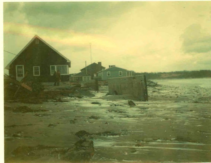
Morning St. bulkhead 1/10/78