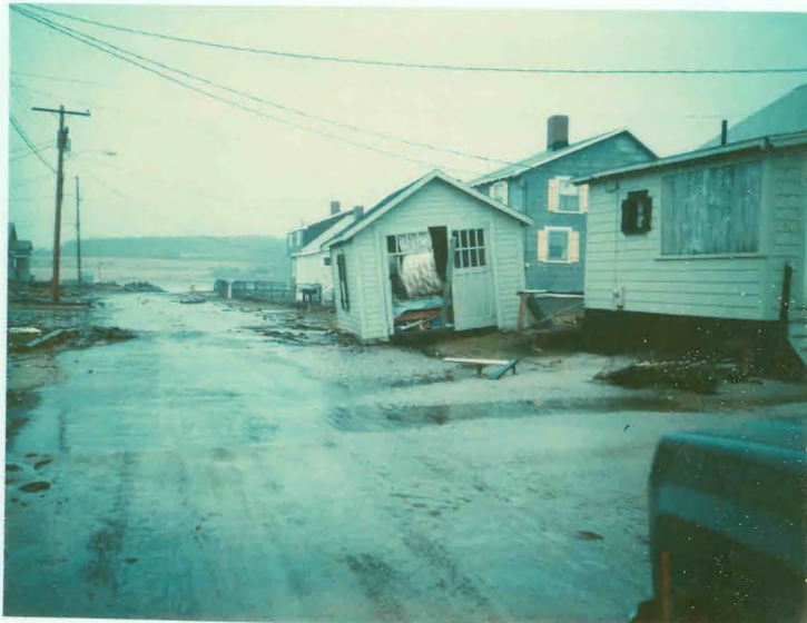
BAYVIEW AVE EXT 1/9/78