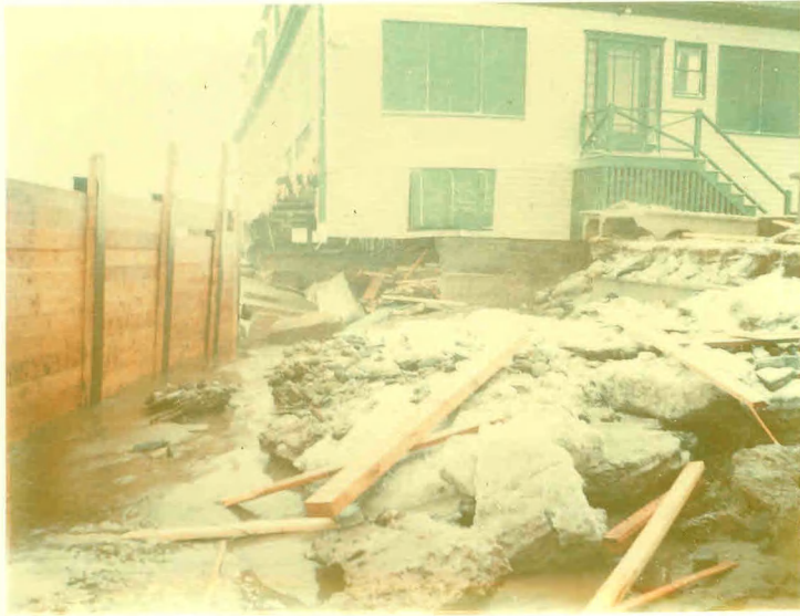
End of Morning St to right at Silver Sands Hotel. 2/7/78