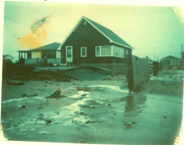
Morning St. 1/9/78