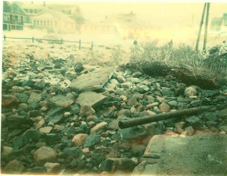
Ashton St. sign Ocean towards Bayview 2/7/78