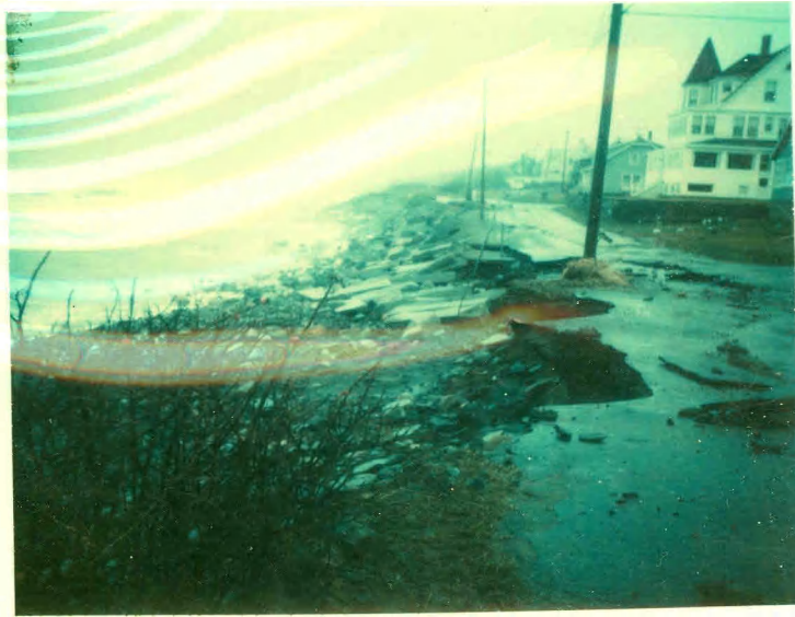
Bayview & Ocean Ave 1/9/78