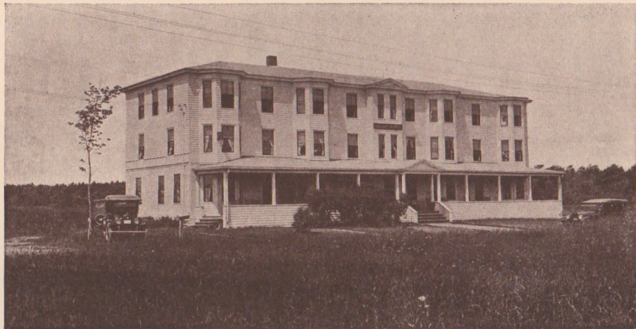
HIGGINS INN, HIGGINS BEACH, MAINE