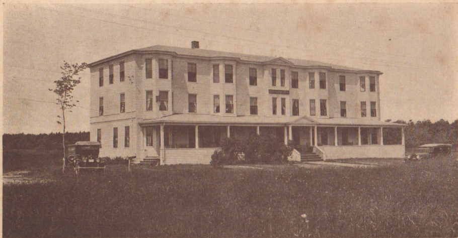
HIGGINS INN, HIGGINS BEACH, MAINE