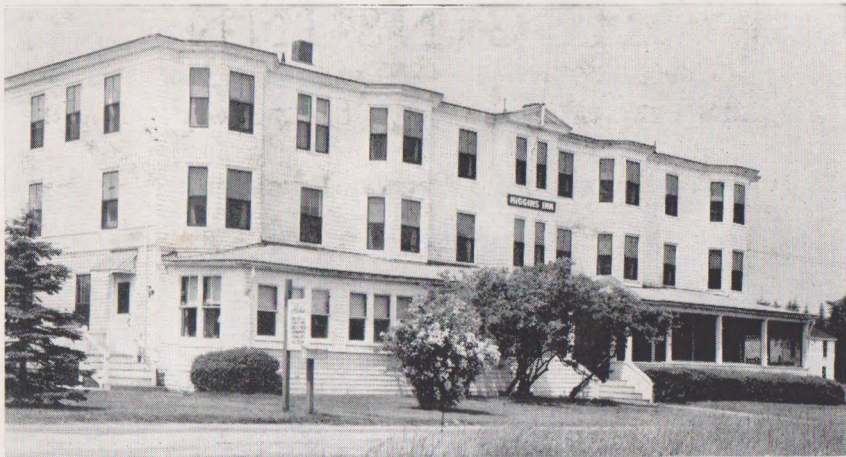
HIGGINS BEACH, SCARBOROUGH, MAINE